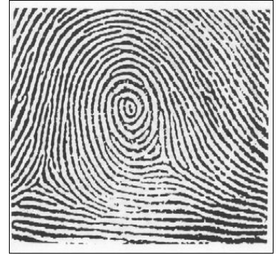
Central Pocket Loop